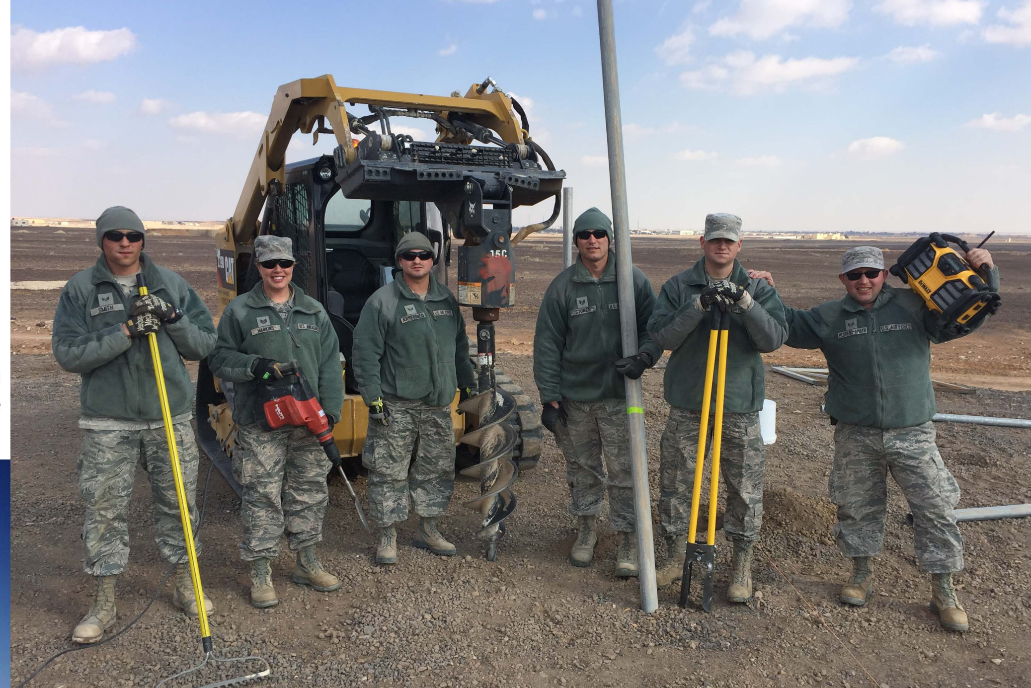
(right, below) Members of the 102nd Civil Engineer Squadron working and showing pride for the home team.