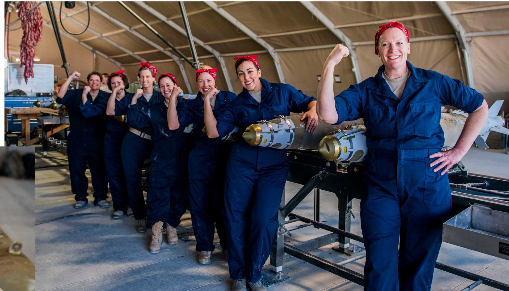
Women dressed as 'Rosie the Riveter' pose for a photo with GBU-38 bombs Mar. 7, 2017, in Southwest Asia. These women are Airmen in the U.S. Air Force and built a dozen bombs in honor of Women's History Month.

These women are attached to a combat wing, which is setting monthly 'bombs dropped' records in support of the fight against ISIS. With this year's WHM theme being 'Honoring Trailblazing Women in Labor and Business' having these ladies roll up their sleeves, to be a part of the mission first-hand, helped serve as a reminder that women are an important part of the military.