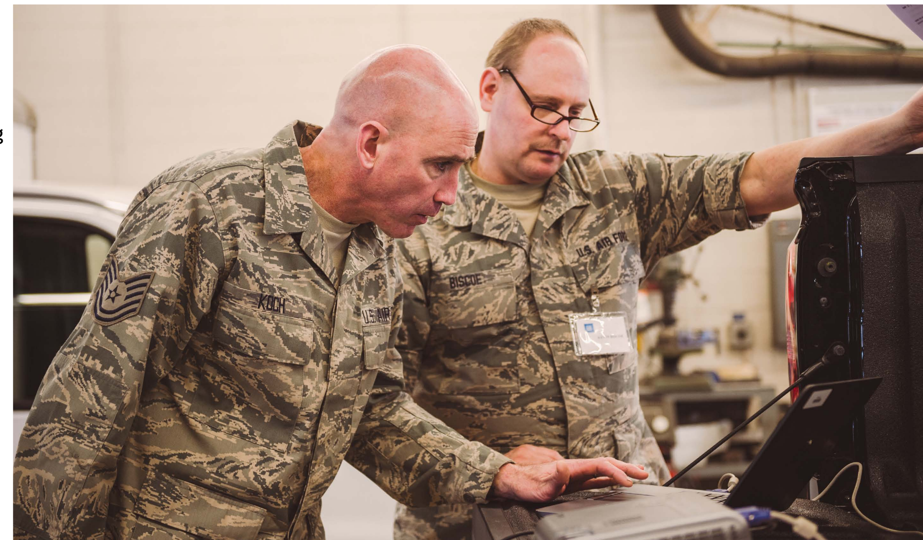
Airmen utilize the latest resources that General Motors and AC Delco regional instructors demonstrated in order to solve training scenarios that will improve their ability to diagnose and repair vehicles at their home units, Niagara Falls Air Reserve Station, N.Y., Feb. 22, 2017. The training was tailored to specifically meet the needs of the Airmen so they could gain new skills on situations they may run into at their home units.