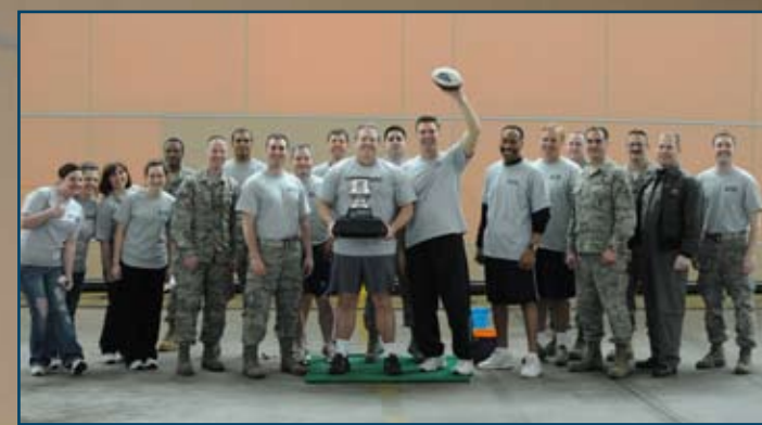
Members of the 102nd Air Operations Group celebrate after winning the Commander's Cup trophy, April 2.