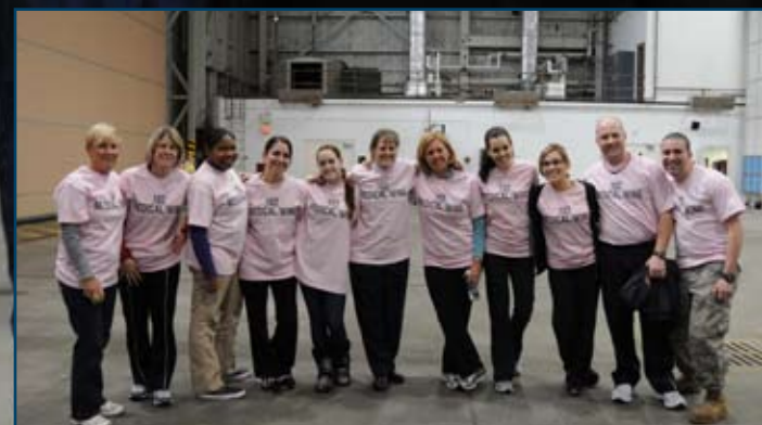
Members of the combined 102nd Medical Group-102nd Wing Group team show off their intimidating pink Team T-shirts during the Commander's Cup competition, April 2.