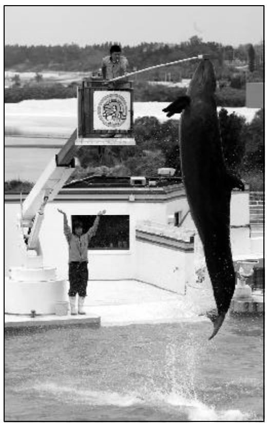
One of the local recreational activities was a visit to the nearby Churami Aquarium at the Okinawa Ocean Expo Park.

Major Fragano said the main differences between the F-15s are better fuel capacity and an improved environmental system on the Cs and Ds.