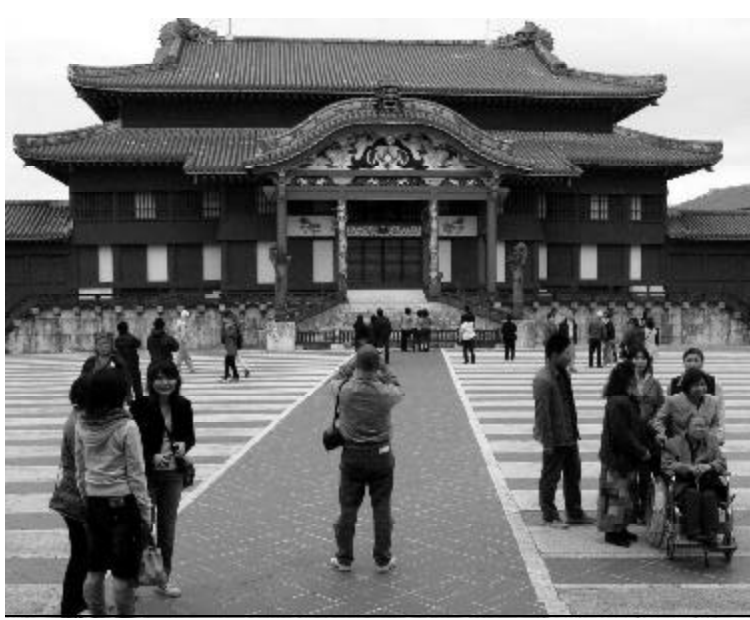
Another tourist attraction for 102nd personnel in Japan was Shurijo Castle.