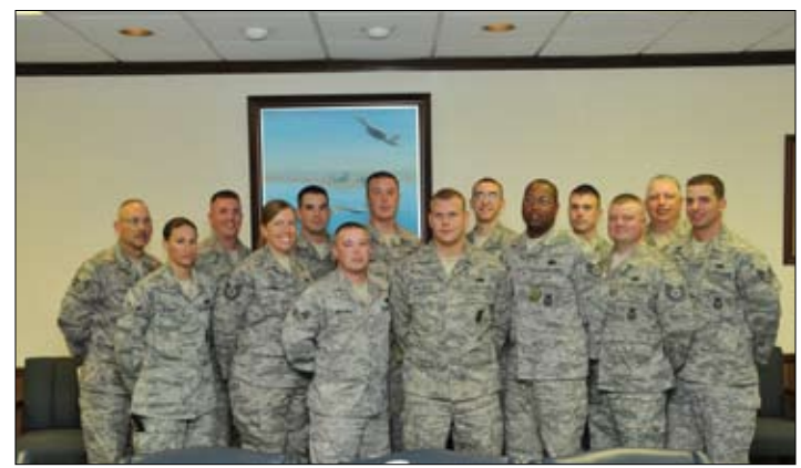
102nd Security Forces Airmen in the Wing Conference Room here after their final outprocessing. The Airmen are on a six month deployment to southwest Asia providing security services in support of Operation Iraqi Freedom.