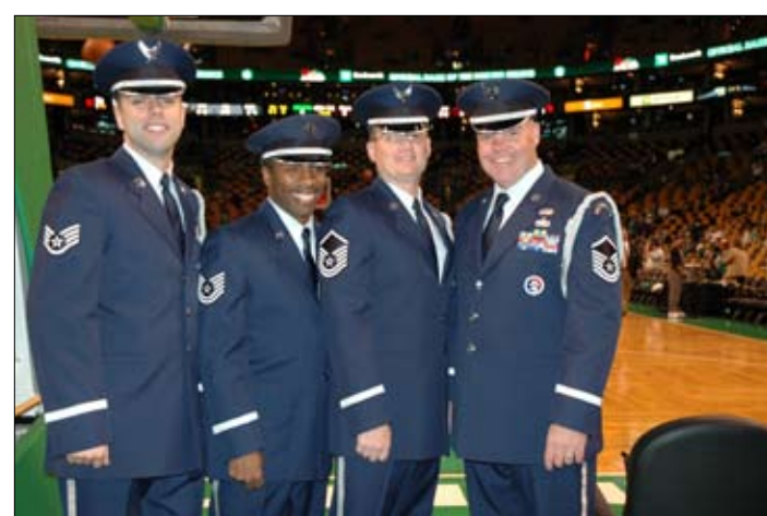
Otis Honor Guard Airmen prior to posting the colors at the Boston Celtics' 2008 season opener against the Cleveland Cavaliers, Oct. 28.