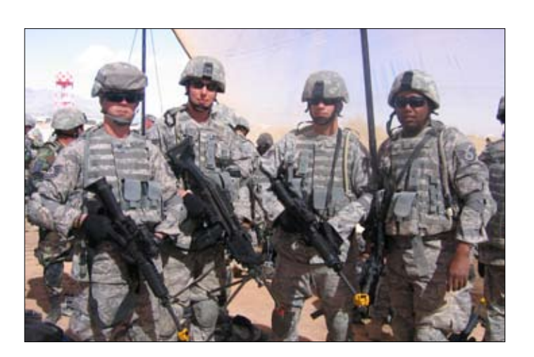
102nd Security Forces Airmen in full "battle rattle" during Combat Skills Training at Fort Bliss, Texas. The Airmen attended the Combat Skills Training course to prepare for their current six month deployment to southwest Asia.