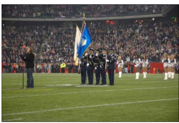
Otis Honor Guard Airmen post the colors prior to kickoff of the New England Patriots' Monday Night Football game against the Denver Broncos, Oct. 20.