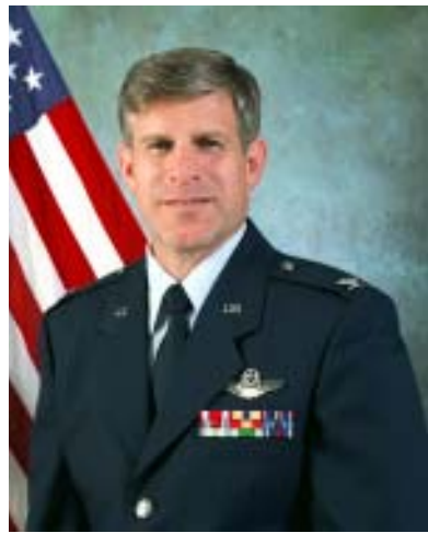
From the wing commander's desk